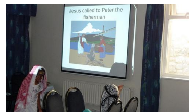
Jesus talking to Peter in his fishing boat

In July our theme was Biblical seashores. The worship focused on Jesus calling the fishermen and the younger members marched around the room singing ‘We are marching in the light of God’, but with additional verses such as ‘We are fishing in the love of God’. Messy Church is but one illustration of how our newly refurbished church will contribute to the diverse worshipping life of our church community. I am really looking forward to taking Messy Church into the church for our worship time. The new warm floor, moveable seating, welcoming entrance doors and beautiful, spiritual ambience will be wonderful for Messy Church worship.